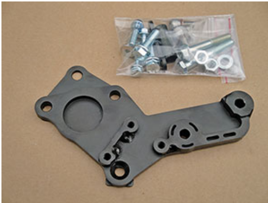
No air pump version