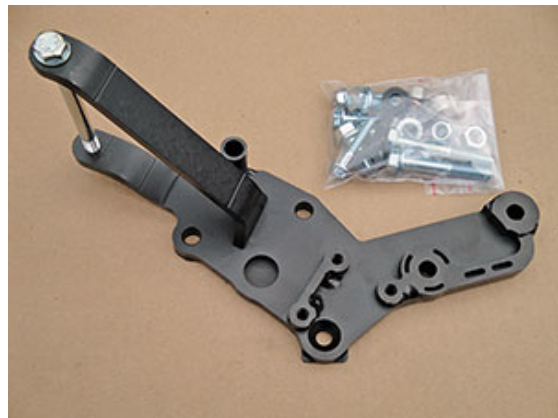
Air pump version